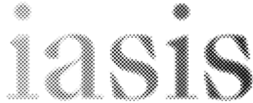
IASIS Med (GR)