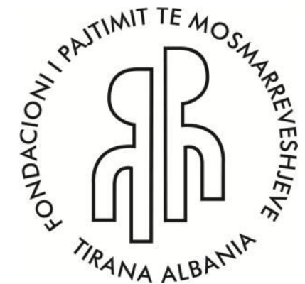
Albanian Foundation "Conflict Resolution & Reconciliation of Disputes" (AFCR)