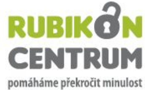
Rubikon Centrum (CZ)